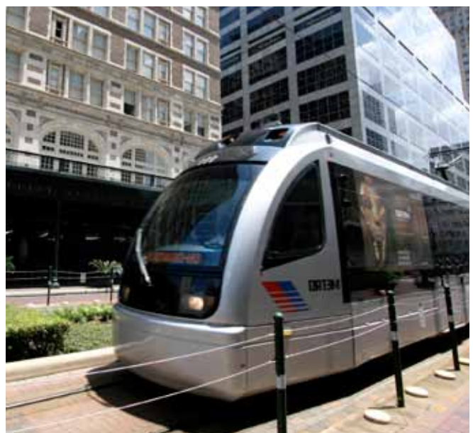
▲ In 2008, light rail had the highest percentage of annual ridership growth among all transit modes—an 8.3 percent increase. (Photo - Houston Light Rail, Ed Schipul.)