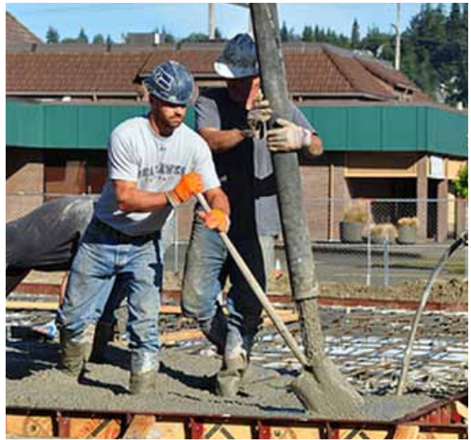
▲ The recent American Recovery and Reinvestment Act, funding projects such as this future transit center in Aberdeen, Washington, has accelerated transit expansion.

By taking these approaches, we can create a future where every American can get to work and school via public transportation—subways, rail, buses, walking, and biking. People are voting with their feet and moving to public transportation in increasing numbers—it is imperative that policy and investments accentuate and accelerate this trend in order to achieve energy independence and solve global warming.