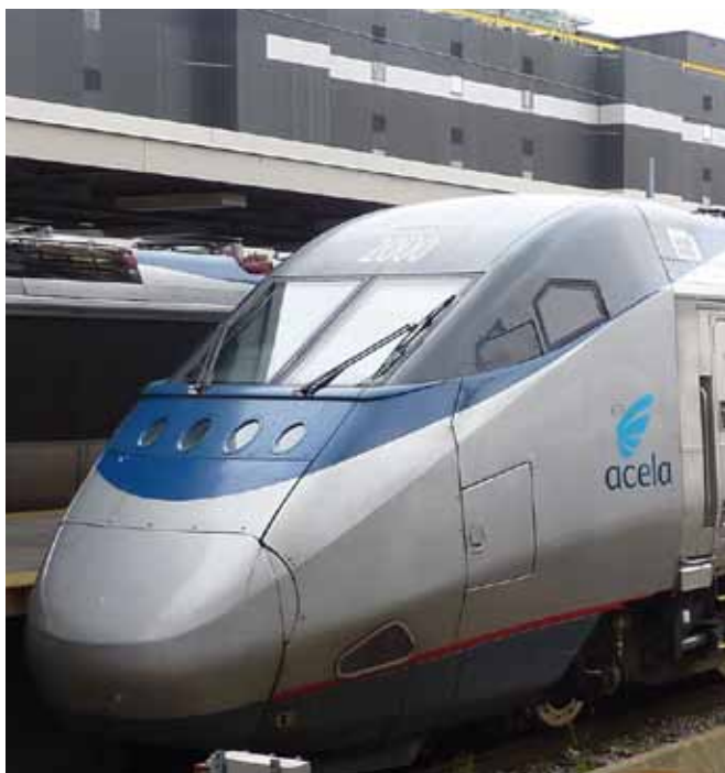
▲ Four in five Americans believe increased investment in public transportation strengthens the economy, saves energy, creates jobs, helps reduce traffic congestion and decreases air pollution.

A century ago, trolleys and streetcars—the precursor of today's modern light rail and subway systems—facilitated the growth of American cities large and small, giving people more trans-