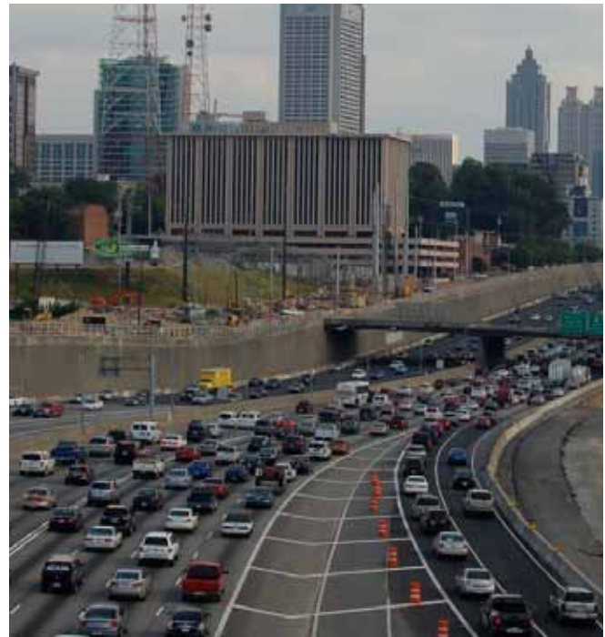
▲ Transportation accounts for about two-thirds of all U.S. oil use—nearly 13 million barrels of oil per day.

Record ridership shows clear, growing demand for public trans-