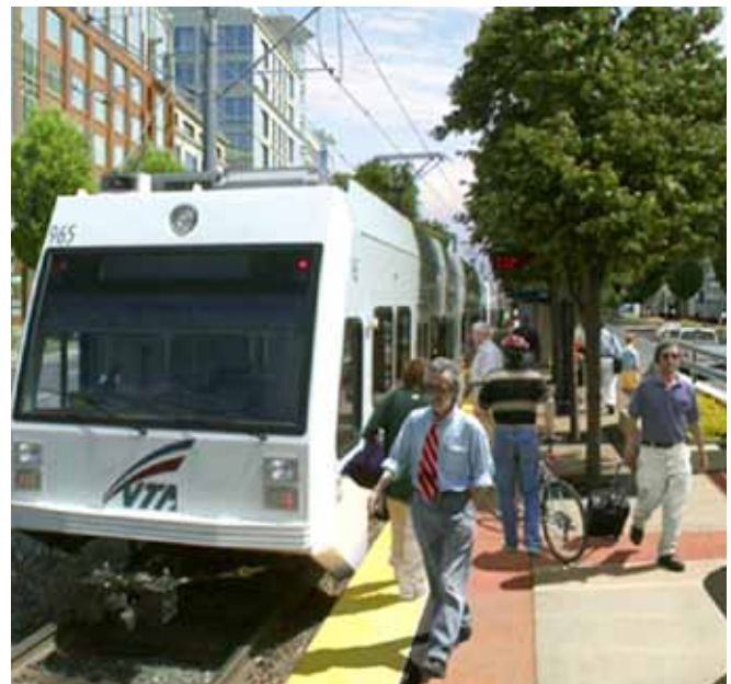
▲ Four in five Americans believe increased investment in public transportation strengthens the economy, saves energy, creates jobs, helps reduce traffic congestion and decreases air pollution.

Existing systems would undergo significant expansion, allowing the largest urban systems to expand heavy rail and grow light rail and bus rapid transit systems linking urban centers and suburban areas. Commuter rail and new high-speed rail