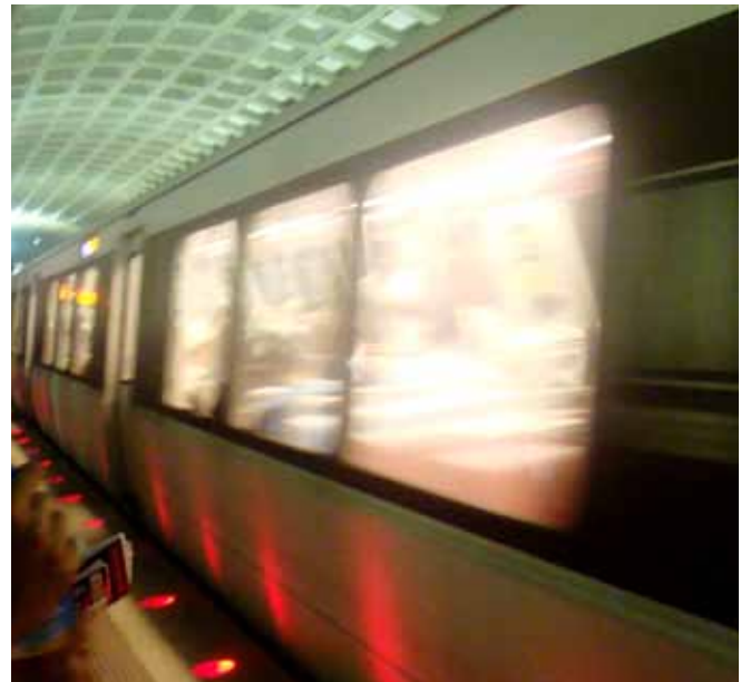
▲ Nationwide, transit is estimated to reduce vehicle miles traveled (VMT) by more than 102 billion miles driven per year.

Table 4 illustrates fuel and carbon savings from each state