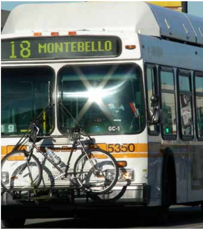
▲ With advances in cleaner fuels, like this bus running in compressed natural gas, public transportation is becoming more efficient and less polluting over time.

is consumed for low-density housing and commercial development;