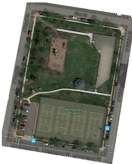
Current view