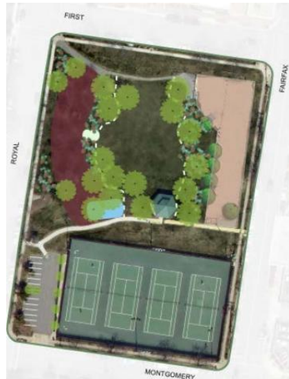
Future plan via City of Alexandria