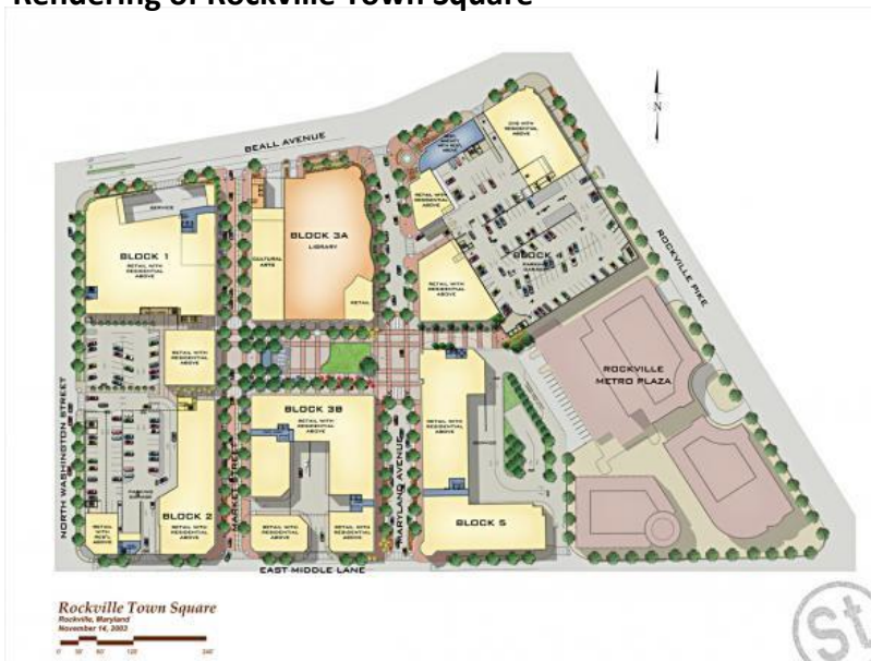
Rockville Town Square