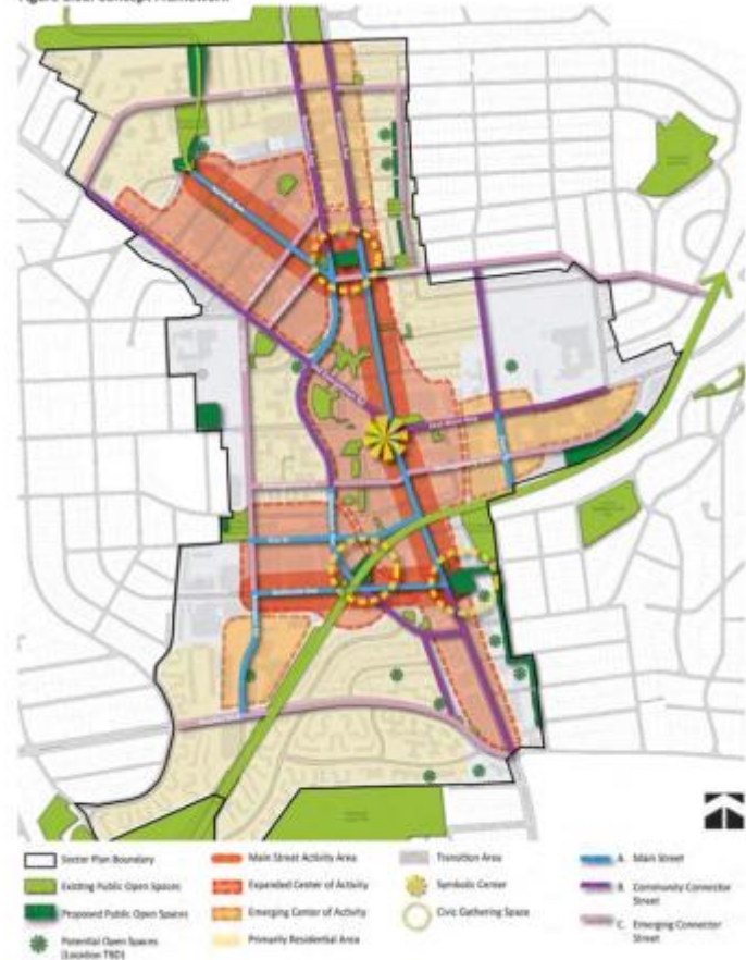
Figure 1.01: Concept Framework