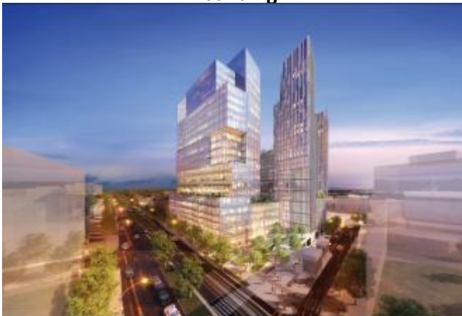
Rendering of the redeveloped Apex building